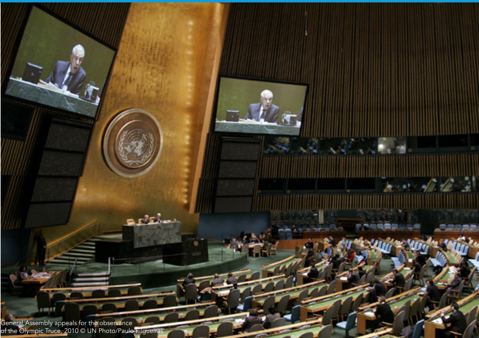
General Assembly appeals for the observance of the Olympic Truce, 2010